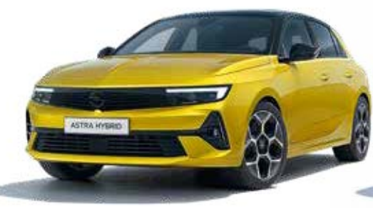
Yellow Amber Solid paint